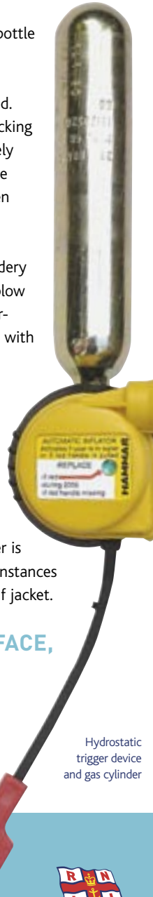
Hydrostatic trigger device and gas cylinder

If you are at all unsure about maintaining your lifejacket, then it should be serviced annually by a qualified agent.